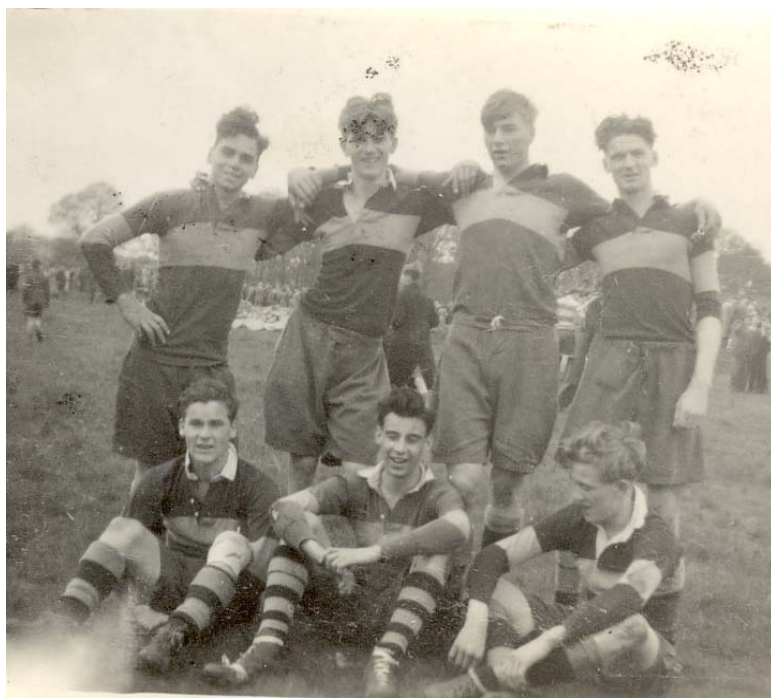
EMANUEL 7s 1945