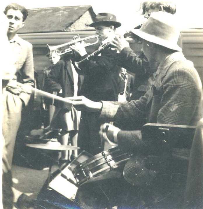
DEPARTURE FROM PETERSFIELD 1945